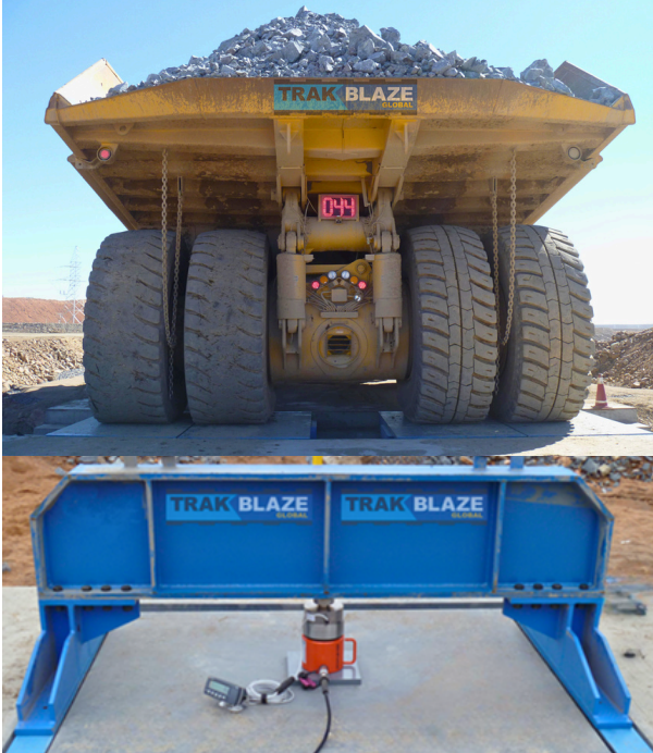
FORCE being tested and calibrated at site with a portable test press unit