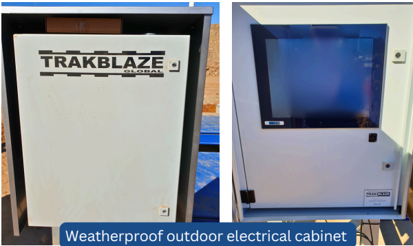
Weatherproof outdoor electrical cabinet