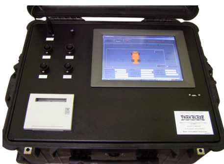
PC based controller with built-in printer in carry case