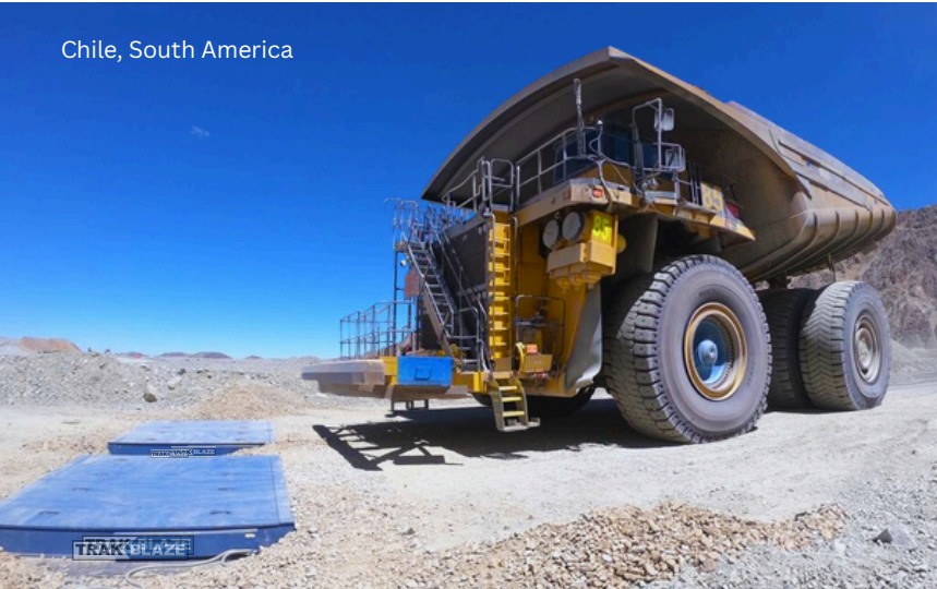
Chile, South America

Proven To Be The World's Toughest Mining Truck Scale